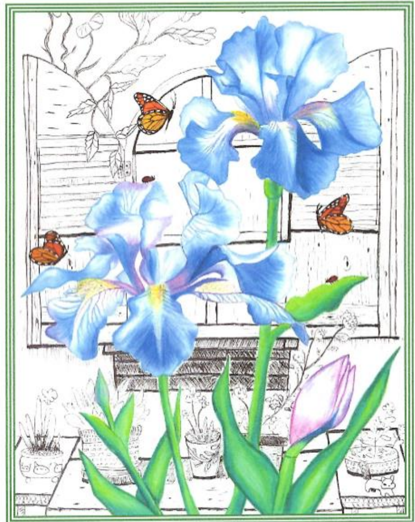
Grand Prize-winning art by Sally Huang, 5 th grade, Leonard Elementary, Troy

NEW: SPECIAL FREE RAFFLE OPPORTUNITY FOR TICKET HOLDERS !